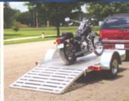
Optional bi-folding ramp available.